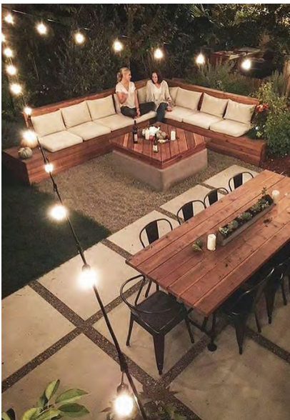
Festoon Lighting in courtyard