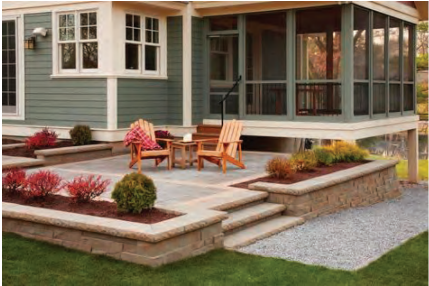
Planters adjacently placed by steps for safety (down from existing patio?)