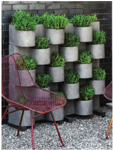
Green Wall Planter