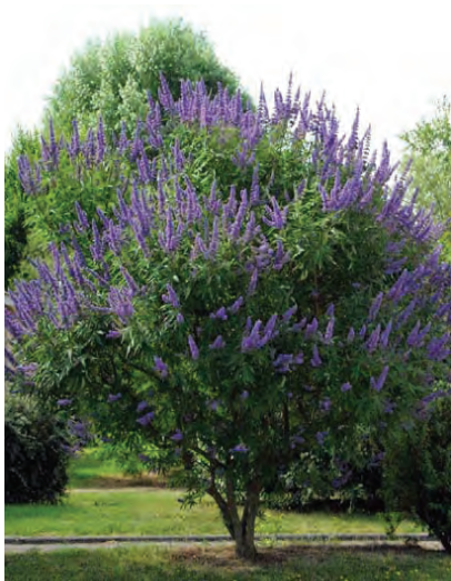
Vitex Chaste Tree