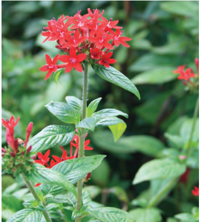
Red Penta- Perennial