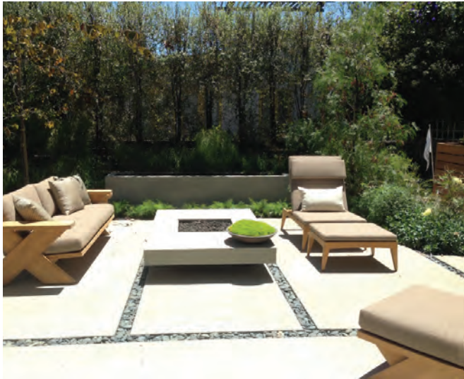
Concrete rectangle pieces with rock grout