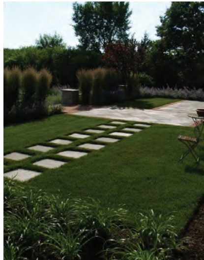
12x12 square walk to patio