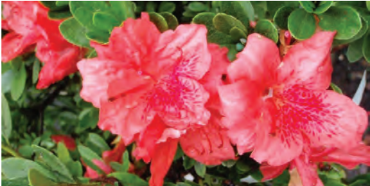
Fashion Azalea in front of foundation hedge