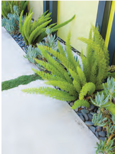
Ferns & succulents- low maintenance