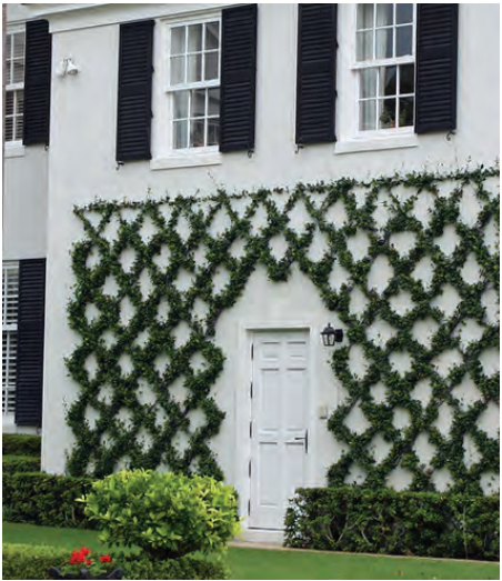
Attached Wire Trellis with Jasmine