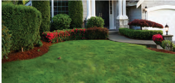
Layers of Landscaping create lush appeal