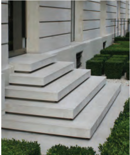
Floating Concrete steps- Modern