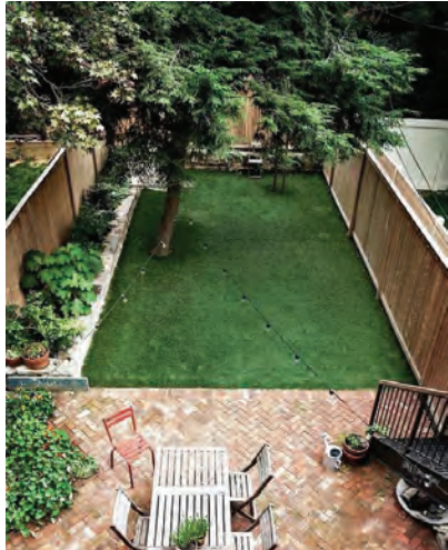
Simple Lawn and patio with focal tree