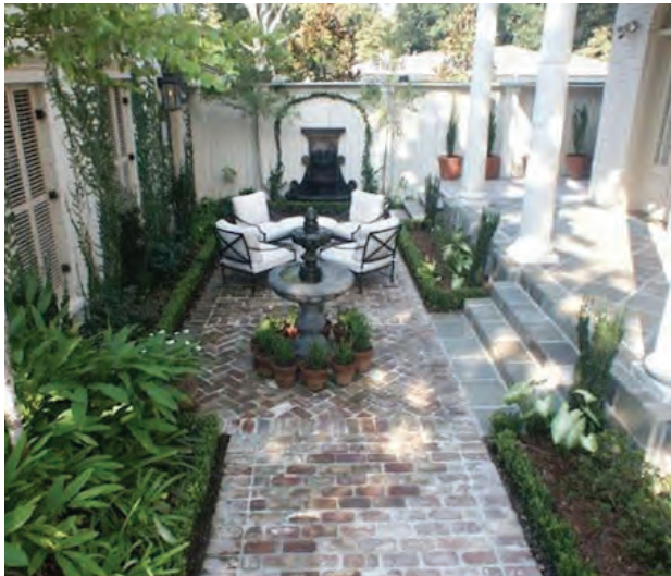
Traditional Rectilinear patio with steps and planting adjacent