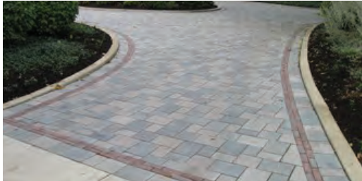
Grey Paver with Brick border