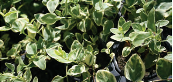
Vinca (Periwinkle)- Low growing groundcover for under Ligustrum