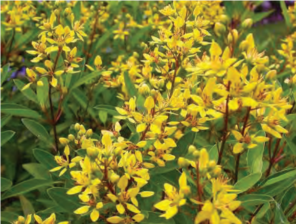
Thyrallis- evergreen flowering hedge