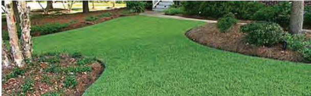
Zoysia with metal edging- clean and low maintenance