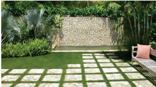
12x12 squares w/ grass- "area" disintegrates in to a walk