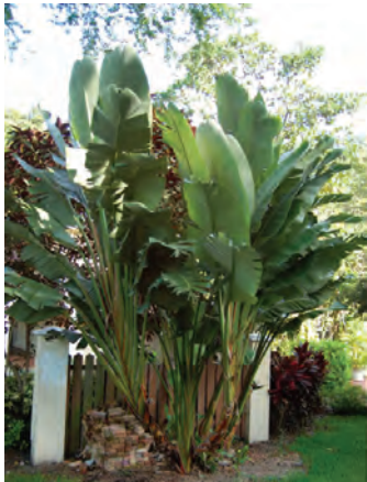
White Bird of Paradise Mature with clear trunk