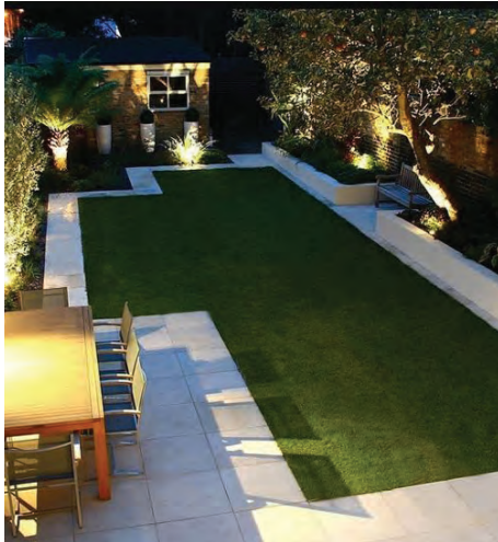
Rectilinear lawn with walkways around- Modern