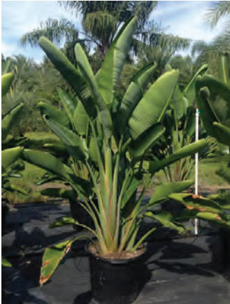
White Bird of Paradise typical size at time of planting