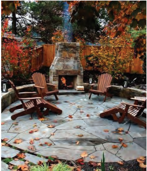
Stone Patio with seating and firepit