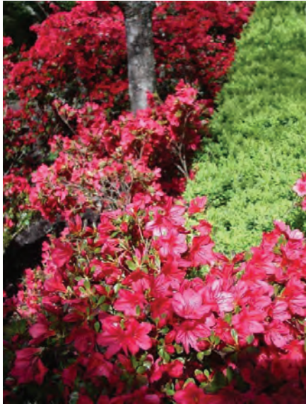
Fashion with Evergreen Hedge