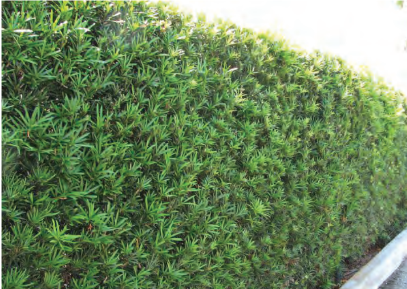
Podocarpus Hedge- As foundation planting