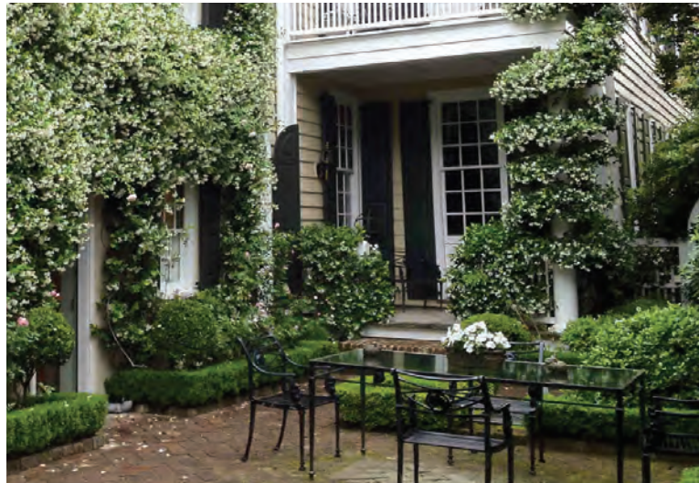
Brick traditional Pocket courtyard with evergreens