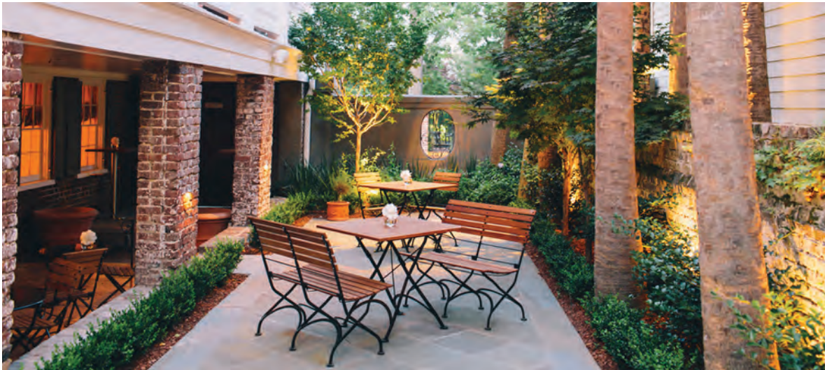
Clean and Simple Patio with clean landscaping