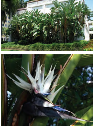
White Bird of Paradise Flower