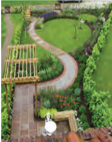
Integrated Lawn and walk- curvilinear