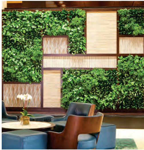
Green Wall Design