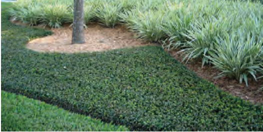
Asiatic Jasmine highlights edge of landscape bed- frames flowers